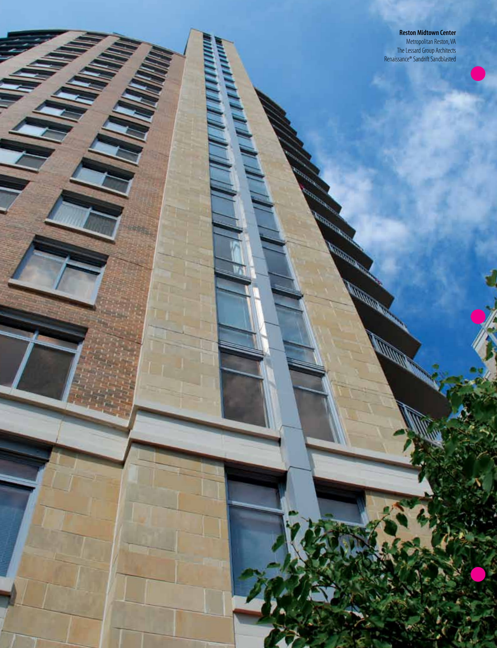
Reston Midtown Center Metropolitan Reston, VA The Lessard Group Architects Renaissance® Sandrift Sandblasted