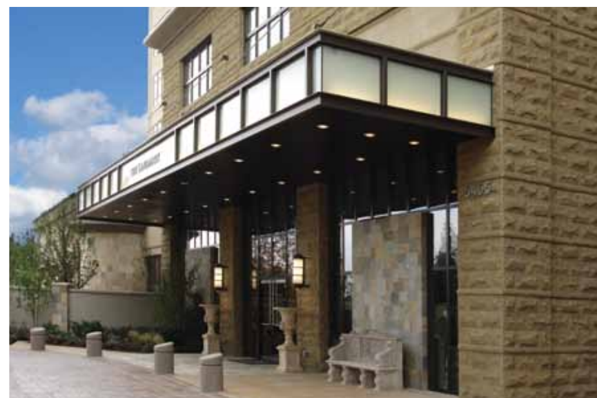
Top Left: Renaissance® White Rocked