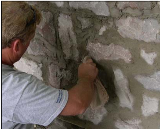
Use of burlap or a non-staining piece of carpet gives a softer finish around the stone edges creating a “bagged” or “carpet” joint.