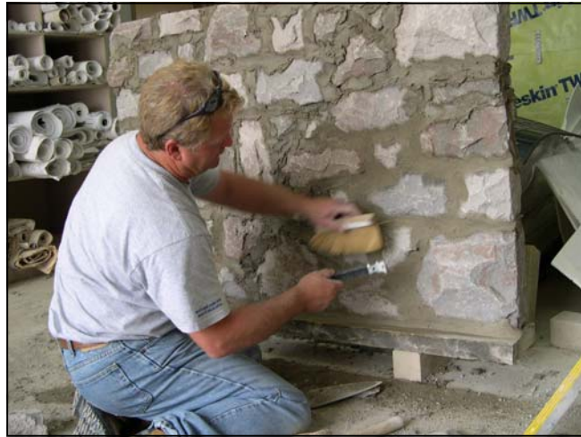
After tooling, brush excess mortar from the stone surfaces utilizing steel and soft fibre brushes.