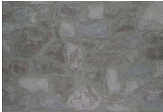
When fully cured this bagged joint blends into the stone giving a very rustic look.

Even with the additional stone chiseling, the random lay-up pattern allows the mason to maintain a high rate of production.