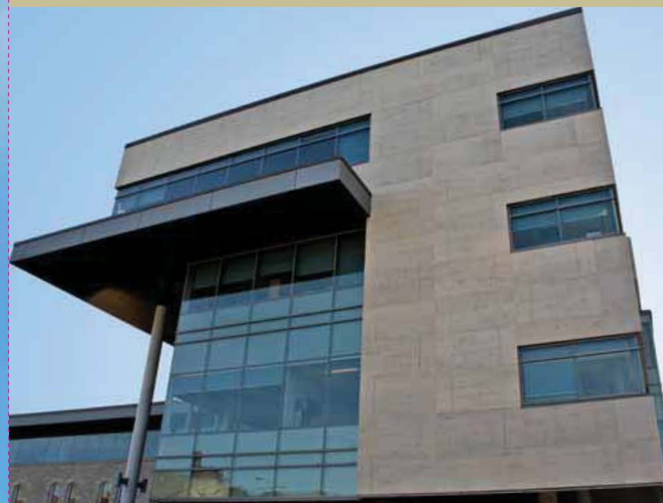
Guelph Civic Center Guelph, ON Moriyama & Teshima Architects Sepia Veined Panels

Arriscraft offers manufacturing, technical and industry leadership with over 45 years of quarry operation experience and capacity exceeding 30,000 metric tons of quarry blocks.