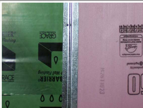
Step 4: Install "Z" channels and then Rigid Insulation between "Z" channels