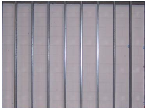
Step 1: Steel Studs