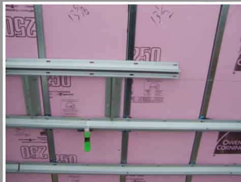
Step 5: Install Gridworx Channels over "Z" channels and rigid insulation