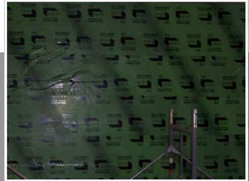
Step 3: Waterproofing Membrane