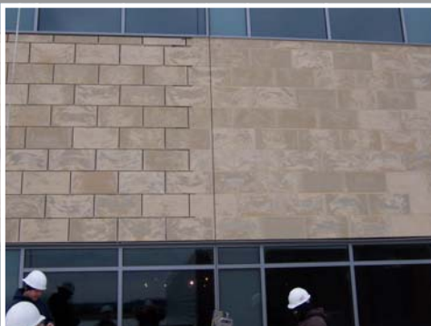
Step 7: Joints Sealed with Backer Rod and Silicone Sealant